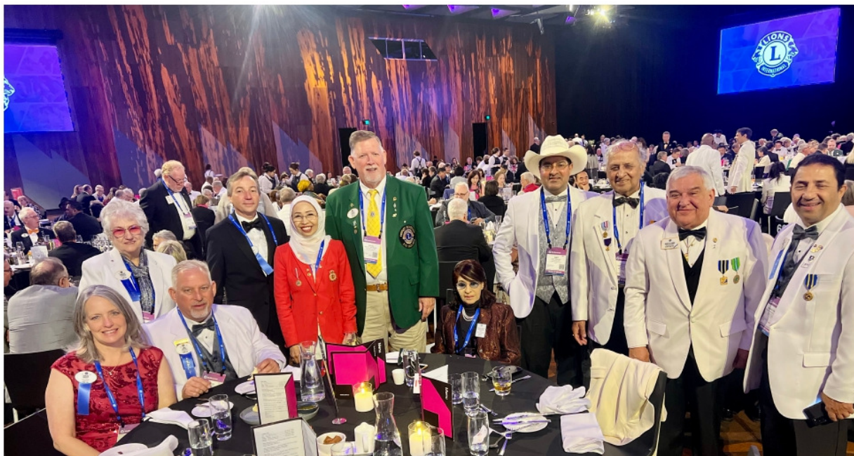
At PIP, PID, PDG, DG Banquet, June 24, 2024

On the last plenary session, LCIF reached almost 145% of it's goal with over $100 M donations collected in less than 20 minutes! It's a humbling moment when you are surrounded by so many Lions from all over the world and from all walk of life. We are together to serve the world. Check our Facebook page (Lions District 2-X1) for more information and pictures.