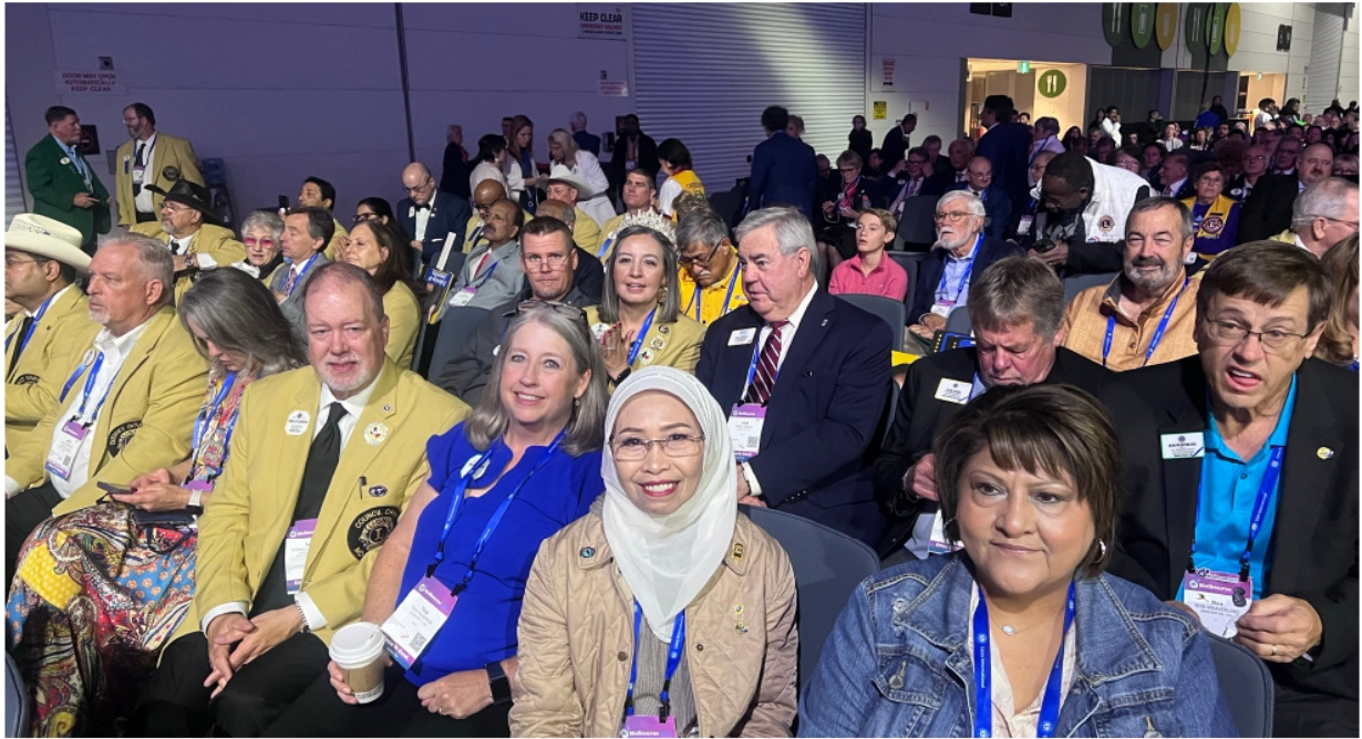
At the 3rd Day Plenary Session, June 25, 2024