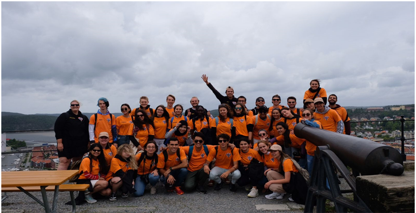
Above: All 35 campers and 4 Camp Leaders

Yes— I took almost 3,000 photos and videos over the three weeks I spent with the Lions of Norway in their Oslo YCE program, Imagine Peace Norway 2023. And 3,000 photos are still far from enough to convey the depth, impact, and magnitude of memories and emotions I experienced. I lived through scenarios I thought existed only in storybooks or film scripts, felt emotions stronger than any I'd ever felt, and learned more about the world and myself than any textbook or lecture could ever hope to convey. Starting with the week I spent with a host family in Snarøya, I got to experience living with people my age for the first time. Okay, that's a bit of a lie— I did live in dorms dur